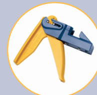
JackRapid™ Punchdown Tool