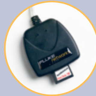
MultiMedia Card Reader