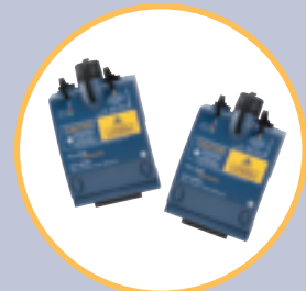
Fiber Module Set