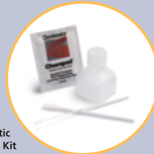
Fiber Optic Cleaning Kit