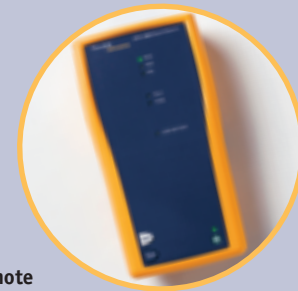
DTX-1800 Smart Remote