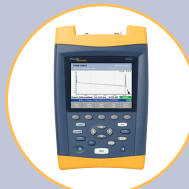
OptiFiber® Certifying OTDR

Check our complete line of SuperVision products like these at www.flukenetworks.com