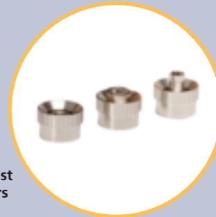
Fiber Test Adapters