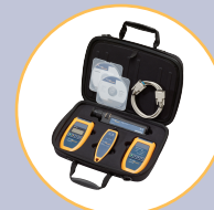
SimpliFiber™ Loss Test Kits