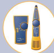
IntelliTone™ Pro Toner and Probe