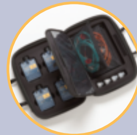
DTX Fiber Modules Carrying Case