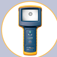
FiberInspector Pro™ Video Microscope